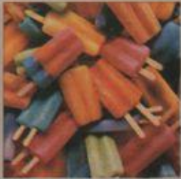
PZL2115 Frozen on a Stick