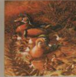
PZL2109 Family Outing