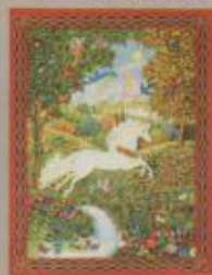
PZL4143 Song of the Unicorn