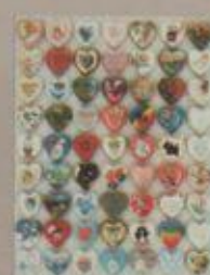
PZL4170 I (Love) Hearts