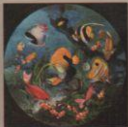
PZL6525 Undersea Enchantment