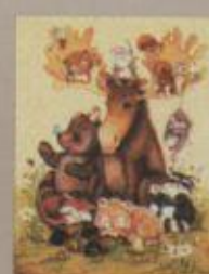
PZL4171 Harmony Hollow