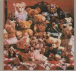
PZL2114 The Best of Friends