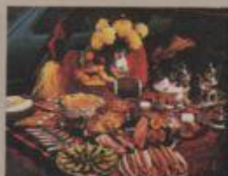
PZL4160 The Goodtime Tailgate Club