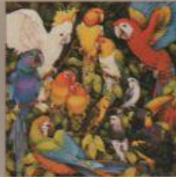
PZL2101 Jungle Birds