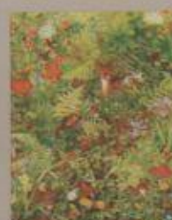
PZL4164 Nature's Awakening