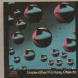
PZL3612 Unidentified Fantastic Objects (Difficult die)