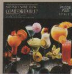
PZL3607 Exotic Drinks (Drink umbrellas included)