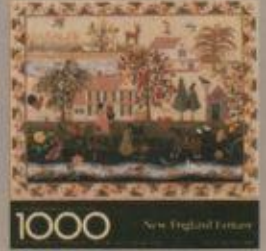
PZL5953 New England Fantasy