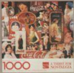
PZL5933 A Thirst for Nostalgia

springbok Puzzles. . . always something new, challenging and exciting!