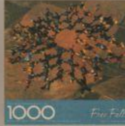
PZL5951 Free Fall