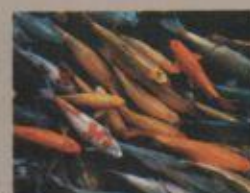
PZL4165* Rush Hour