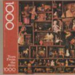
PZL5947 Toys from the Attic