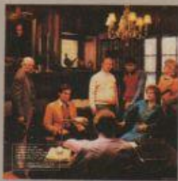
PZL3405 A Puzzle Most Murderous (Mystery book included)