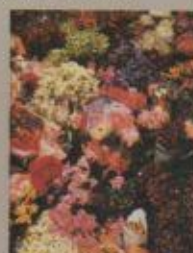
PZL4158* Please Pick the Flowers!