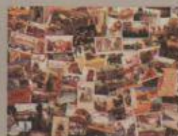
PZL4168 Wish You Were Here