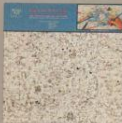
PZL3409 Color Me Purr-fect (Colored pencils included)