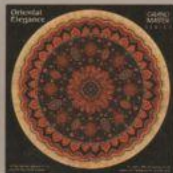
PZL3609 Oriental Elegance