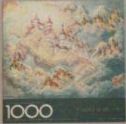
PZL5949 Castles in the Air