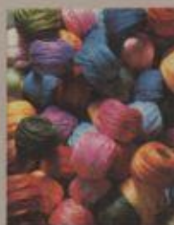
PZL4167 Yarn Balls