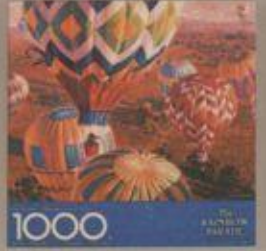
PZL5948* The Rainbow Parade