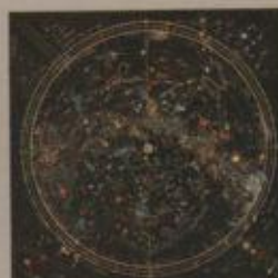
PZL3610 The Puzzle of the Universe (Includes star gazer's booklet)