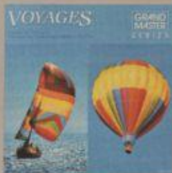
PZL3608 Voyages (Two puzzles in one box)