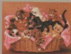
PZL4152 Kitten Caboodle