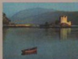
PZL4166 The Castle of Eileen Donan