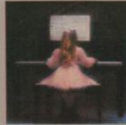
PZL2119 First Recital