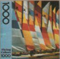
PZL5954 Flying Colors