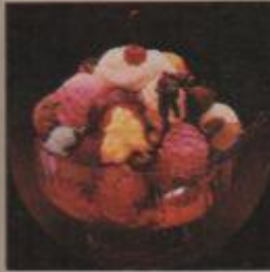
PZL6529 Super Sundae