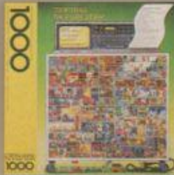
PZL5936 Computers: The Inside Story