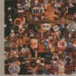
PZL2122 Pick a Winner