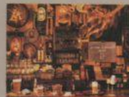
PZL4159 Here's to Happy Hours!