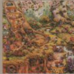
PZL2121 Merry Mousetown