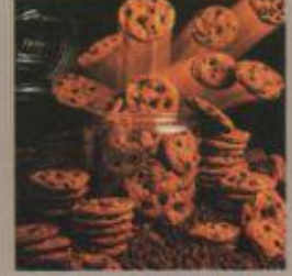
PZL2123 Chip-Chip Hooray!