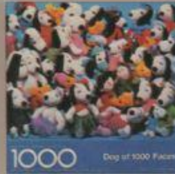
PZL5955 Dog of 1,000 Faces