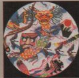
PZL6527 Soaring Spirits