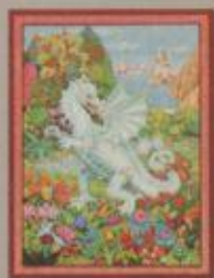
PZL4172 The Land of Dragons