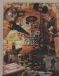
PZL4161 Fan-Tabulous Fifties!