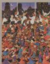
PZL4173 Animal Party

* Featured in the 1983 National Jigsaw Puzzle Championships at the Dairy Barn, Athens, Ohio.