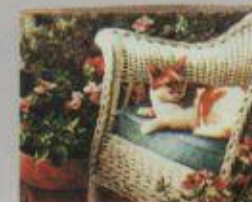
PZL4431 The Princess of the Patio