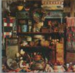
PZL2207 Out of the Attic