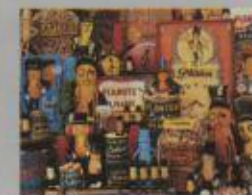
PZL4424 Just Nuts About Mr. Peanut!