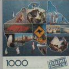
PZL6130 Australia! Down Under is Tops!