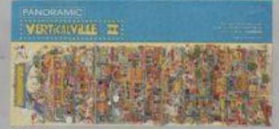
PZL9804 Verticalville II