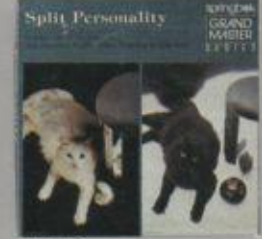
PZL3501 Split Personality (2 puzzles in 1)