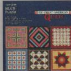
PZL3509 Six Great American Quilts (6 puzzles in 1)