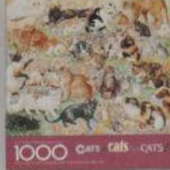
PZL6117 Cats! Cats! Cats!