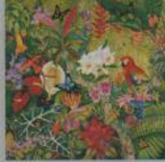
PZL2414 Tropical Exotica