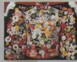
PZL4418 Oh, Do You Know the Button Man