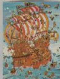
PZL4426 High Jinks on the High Sea!