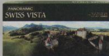
PZL9806 Swiss Vista