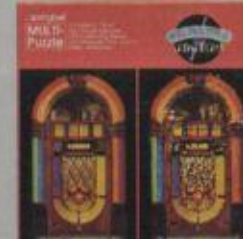
PZL3507 Juke Boxes (2 puzzles in 1)