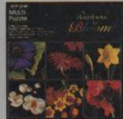
PZL3508 A Rainbow in Bloom (6 puzzles in 1)