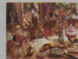
PZL4430 The Essence of Elegance