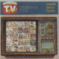
PZL3419 What Was the Name of that TV Show? (trivia booklet included)