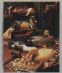
PZL4406 On a Winter Afternoon