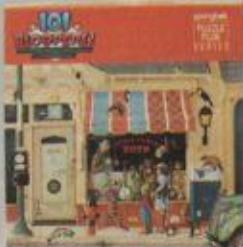
PZL3415 101 Bloopers! (puzzle answers included)