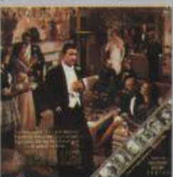
PZL3422 A Star is Iced (mystery booklet included)