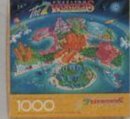
PZL6119 The 7 Puzzling Wonders of the World