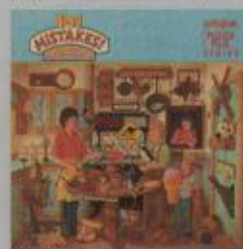
PZL3424 Grandma's Kitchen (puzzle answers included)