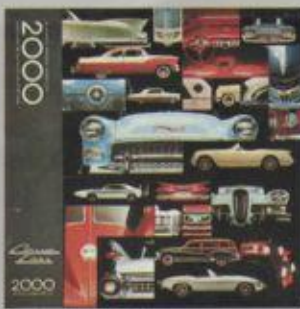
PZL9403 Classic Cars