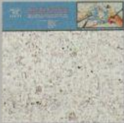
PZL3207 Color Me Purr-fect (6 colored pencils included)