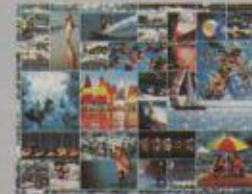
PZL4420 The Water's Fine