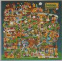
PZL2205 A Short Round of Golf