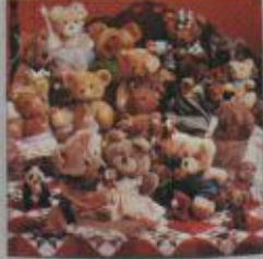
PZL2401 The Best of Friends