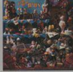
PZL2408 Dime Store Times