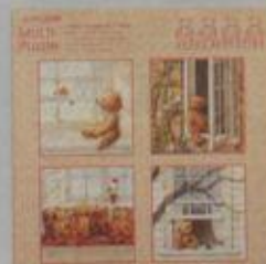
PZL3505 Bears Repeating (4 puzzles in 1)