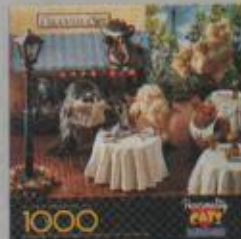
PZL6123 Cats in Purr-ee!