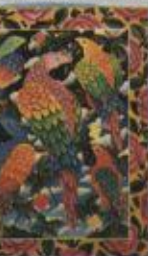
PZL4425 Roses & Parrots