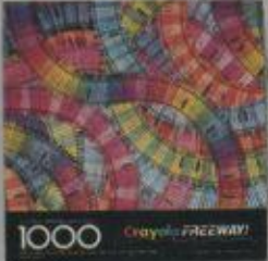
PZL6116 Crayola Freeway