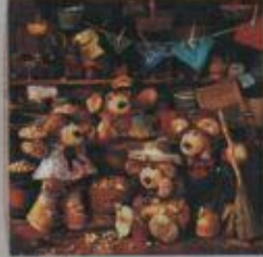
PZL2413 Moody Hollow General Store