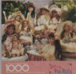
PZL6129 The Dolls' Tea Party