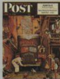
PZL4427 Saturday Evening Post