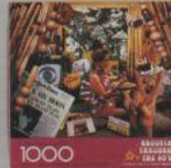
PZL6124 Groovin' Through the 60s