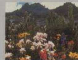
PZL4419 Wildflower Valley