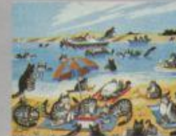
PZL4428 The Cat Days of Summer