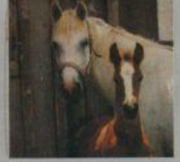
PZL2409 Bluegrass Beauty