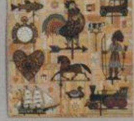
PZL2417 Weather Vanes by Schneeberg