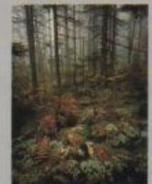
PZL4432 Mystic Woods