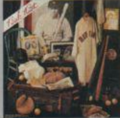
PZL2412 The Babe