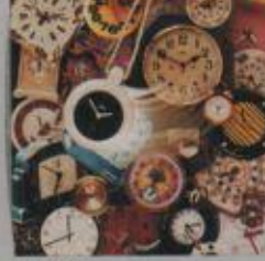
PZL2415 Got A Minute?