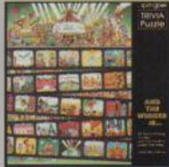
PZL3203 And The Winner Is... (trivia booklet included)