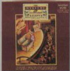
PZL3417 The Mystery of the Vanishing Magician (mystery booklet included)