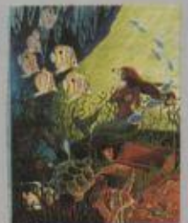
PZL4414 Buccaneer's Dream