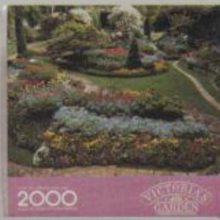
PZL9402 Victoria's Garden