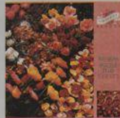
PZL3421 The Bouquet of Beauty (potpourri pouch included)