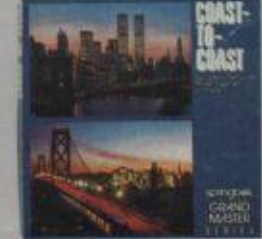
PZL3616 Coast to Coast (2 puzzles in 1)

Shop your Hallmark store for the newest, most innovative puzzle designs in the marketplace!