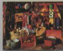
PZL4416 Bridle Suite