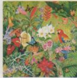
PZL2414 Tropical Exotica