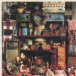
PZL2207 Out of the Attic