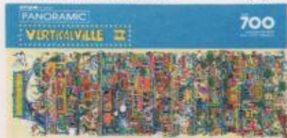
PZL9804 Verticalville II