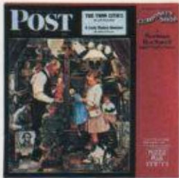
PZL3425 The Saturday Evening Post