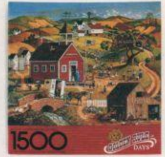
PZL9004 Golden Rule Days