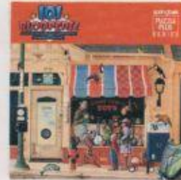
PZL3415 101 Bloopers!