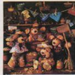
PZL2413 Moody Hollow General Store