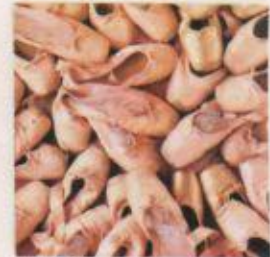
PZL2419 Practice, Practice, Practice!