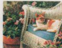
PZL4431 The Princess of the Patio