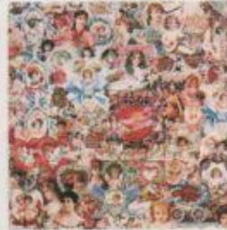
PZL2427 ah, Romance!