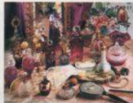
PZL4430 The Essence of Elegance