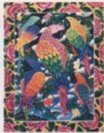
PZL4425 Roses & Parrots