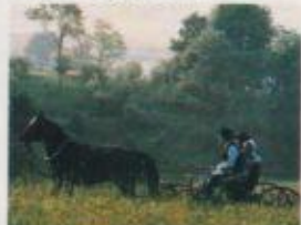
PZL4436 Amish Outing