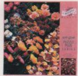
PZL3421 The Bouquet of Beauty (Potpourri pouch included)