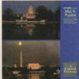
PZL3512 Washington, D.C. (2 Puzzles in 1)