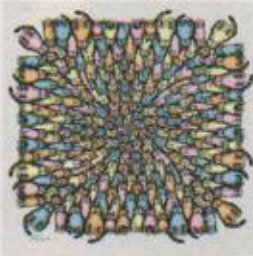
PZL2423 A Close Circle of Friends (Kliban Cats)