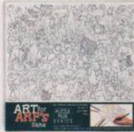
PZL3429 Art for Art's Sake