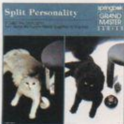
PZL3501 Split Personality (2 Puzzles in 1)