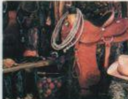
PZL4441 All Quiet on the Western Front