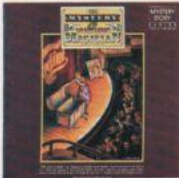
PZL3417 The Mystery of the Vanishing Magician (Mystery booklet included)