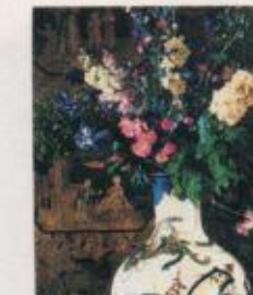
PZL4442 Madderlake Oriental