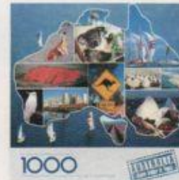
PZL6130 Australia! Down Under is Tops!