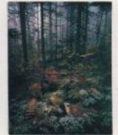
PZL4432 Mystic Woods