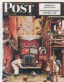
PZL4427 The Saturday Evening Post