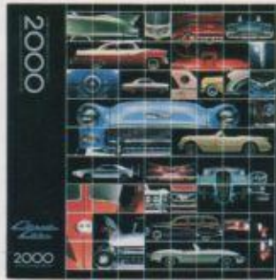
PZL9403 Classic Cars