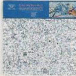
PZL3207 Color Me Purr-fect