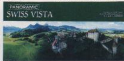
PZL9806 Swiss Vista