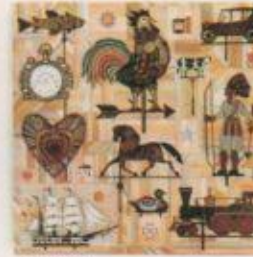
PZL2417 Weather Vanes by Schneeberg