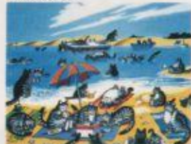
PZL4428 The Cat Days of Summer