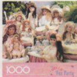
PZL6129 The Dolls' Tea Party