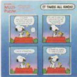
PZL3510 It Takes All Kinds (Peanuts) (4 Puzzles in 1)