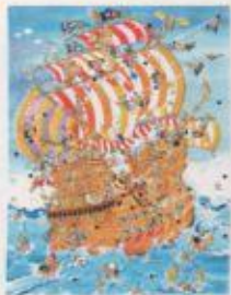
PZL4426 High Jinks on the High Seas