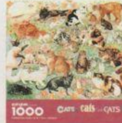
PZL6117 Cats! Cats! Cats!