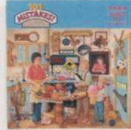
PZL3424 101 Mistakes (Puzzle answers included)