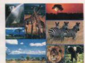
PZL4440 African Anthology