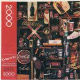
PZL9400 Coca-Cola Centennial