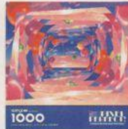
PZL6133 Pixel Perfect!