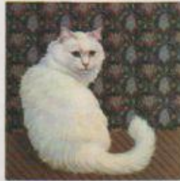
PZL2422 Cosmopolitan Cat