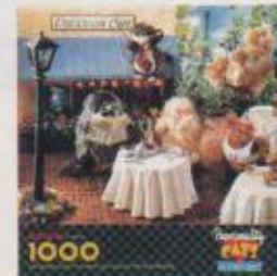
PZL6123 Cats in Purr-ee!