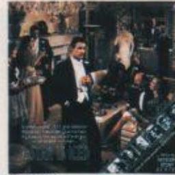
PZL3422 A Star is Iced (Mystery booklet included)