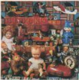
PZL2424 Playthings from the Past

When you want the very best in puzzles . . . just look for the Springbok name!