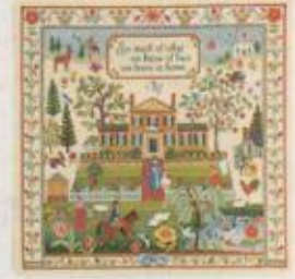
PZL2416 The Art of the Sampler