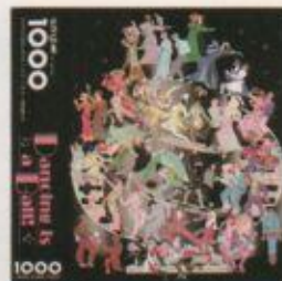
PZL6121 Dancing is a Ball