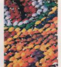
PZL4433 Parasols on Parade