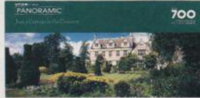
PZL9810 Just a Cottage in the Country