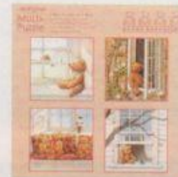
PZL3505 Bears Repeating (4 Puzzles in 1)