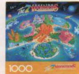
PZL6119 The 7 Puzzling Wonders of the World