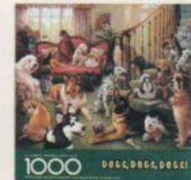
PZL6131 Dogs! Dogs! Dogs!

These are just a few of the exciting puzzle designs you'll find when you shop your local Hallmark store!