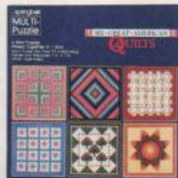
PZL3509 Six Great American Quilts (6 Puzzles in 1)