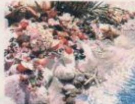
PZL4437 Seashells by the Seashore